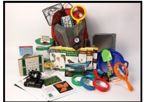
Field Trip Pack

Contact the Kendall County Forest Preserve District Education Department at KCFPEducation@kendallcountyil.gov , or call (630) 553-2292 to check availability and schedule pickup.