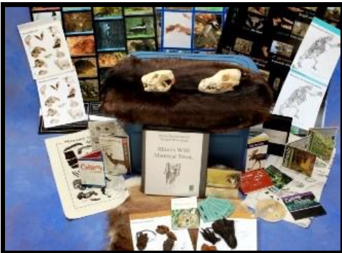
Illinois Wild Mammals Trunk

Teachers are able to check out the following materials from the District's main office located at 110 W. Madison Street in Yorkville: